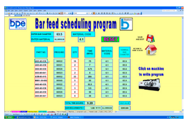
The scheduling system controls quantities, machining programs and setting routines

Components have been re-designed to enable and improve machining on the Integrex. A high capacity 120-tool changer system was purchased with the machine, but even this would not accommodate all the tools that were needed previously, especially when provision has to be made for sister tooling. Steve Randerson gave the designers a far shorter list of tools that could be used to machine all the jobs in all the different materials - a number of changes were made to accommodate this. Not only that, but they also took a far more sensible view on tolerances and surface finishes, with blanket tolerances on surfaces thrown out and each feature closely examined to see what was actually necessary for function and appearance.