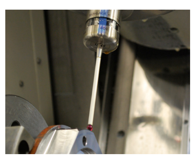
Mazak Integrex multi-axis mill-turn machine with Renishaw OMP400 in

If it is undersize the billet is rejected before the machine wastes time attempting to cut it. Features on the billet may be measured by the touch probe during the machining cycle,